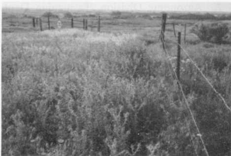
FIGURE 2. Portion of bermudagrass pasture in McClain County, OK, heavily populated with Carthamus lanatus L., distaff thistle, May 22, 1986.

Meadly (8) discusses ecological relationships of Carthamus lanatus . Its dispersal in Australia has been "due, in the main, to the distribution of hay, chaff, and grain containing seeds of the weed", an appraisal also given by the Tasmanian Journal of Agricul-